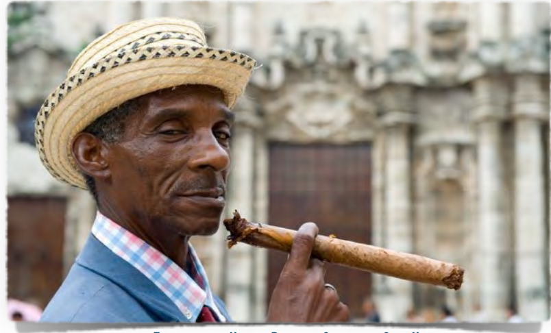
ENJOYING A HAND-ROLLED CIGAR IN OLD HAVANA