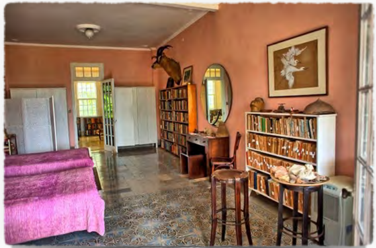
FINCA VIGIA - HOME OF ERNEST HEMINGWAY