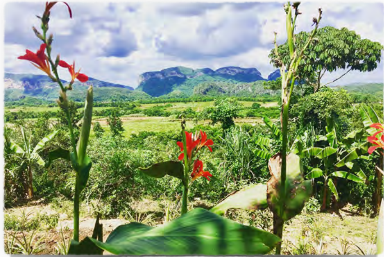
FINCA AGROECOLOGICA VIÑALES