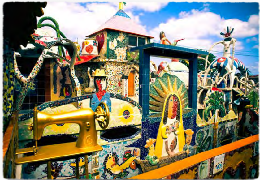
JOSÉ FUSTER'S MOSAIC PROJECT