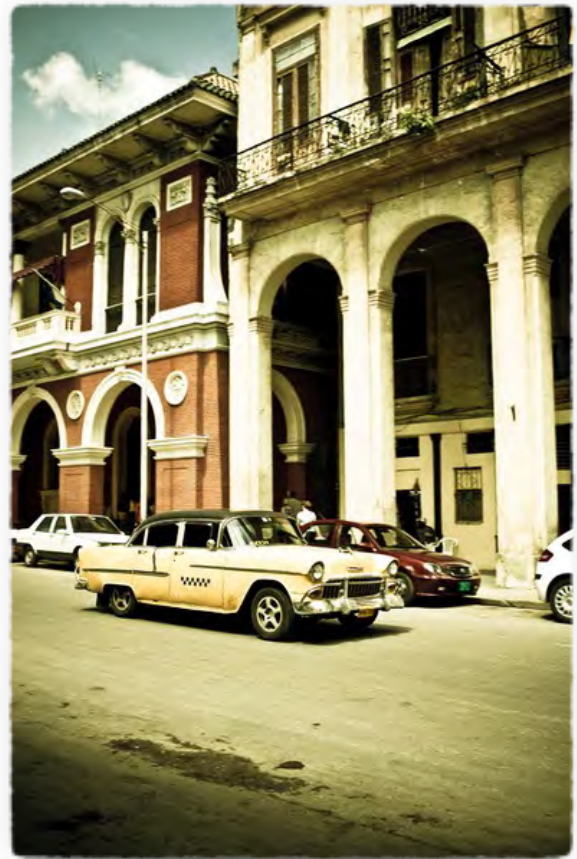
STREET SCENE - OLD HAVANA