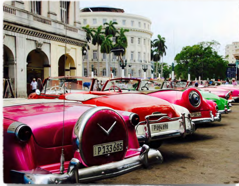
CLASSIC AMERICAN CARS IN OLD HAVANA